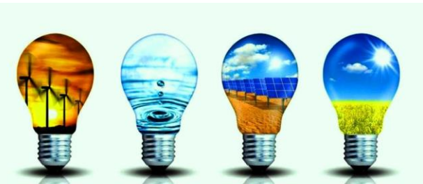
Renewable & Green Energy