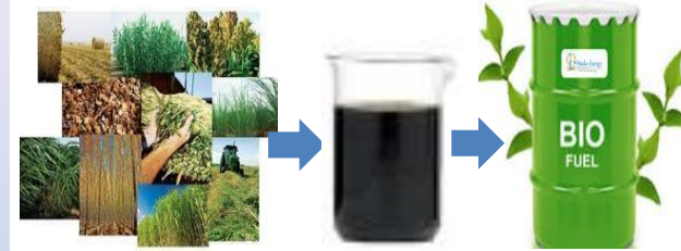
Biomass Thermochemical Conversion